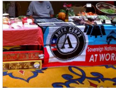
Mescalero Apache Tribe Adapts to a Warmer and Drier Climate