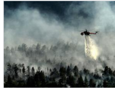
Charting Colorado's Vulnerability to Climate Change