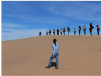
Navajo Nation: Hotter, Drier Climate Puts Sand Dunes on the Move

Communities and businesses are taking action to reduce their vulnerability to climate-related impacts and to build resilience to extreme events. The stories below illustrate the application of the process and tools featured in this Toolkit. Browse the stories, or filter by topic, step to resilience, and/or region in the boxes above. To expand your results, click the Clear Filters link.