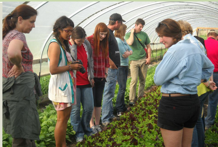
Climate Masters participants learn about farming operations at a tour of Robinette Farms.

Drought Planning Resources by State: http://www.drought.unl.edu/Planning/PlanningInfoByState.aspx