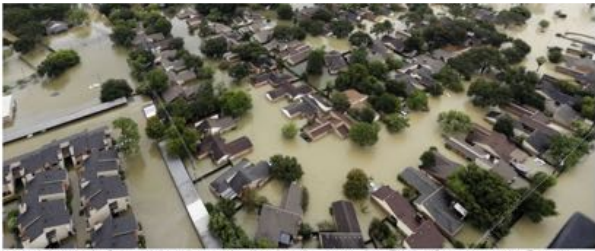
Water from Addicks Reservoir flows into neighborhoods as floodwaters from Tropical Storm Harvey rise Tuesday, Aug. 29, 2917, in Houston