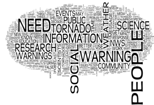
Figure 1: Word Cloud from Cross Cut Session notes. Most common words in notes are in largest font.

Participants were first grouped into "Communities" of expertise: communications, emergency decision makers, operations, physical scientists, policy specialists, risk management and community resiliency, and senior management (See Section 4). Each community group identified critical issues hindering the nation's resiliency against tornadoes. Participants were then divided into cross-community groups ("Cross Cut Breakouts") in which attendees shared perspectives of events of 2011 and their unique professional insights on the challenges we must overcome to meet our goals. The diversity of participation within the Cross Cut sessions produced a set of themes which were used to inform the community groups as they reconvened during the final sessions of the symposium.